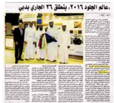
Al Watan - UAE, 3 rd of April 2016