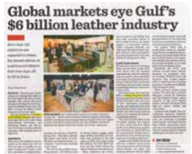
Times of Oman - Oman, 12 th of March 2016

Be part of the story for 2017 and take advantage of our free in-house public relations service.